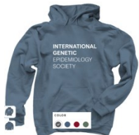
Pullover Hoodie $37.99