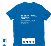
Allmade Organic Cotton Unisex Tee $32.99