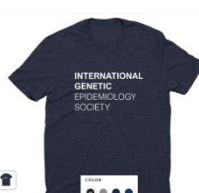
Allmade Eco Triblend Unisex Tee $34.99