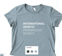
Allmade Eco Triblend Women's Scoop Neck Tee $35.99