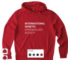
Allmade Organic French Terry Pullover Hoodie $62.99