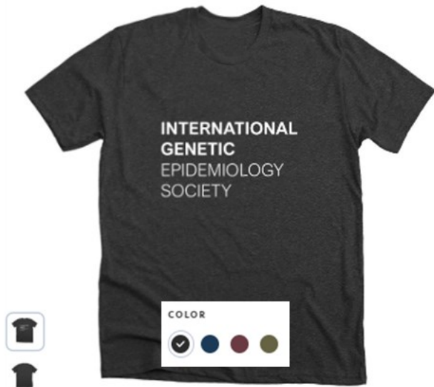
Premium Unisex Tee $27.99