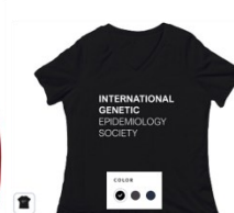
Allmade Eco Triblend Women's V-Neck Tee $32.99